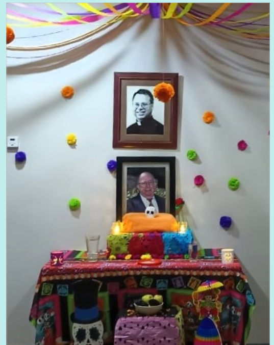
Día de Muertos