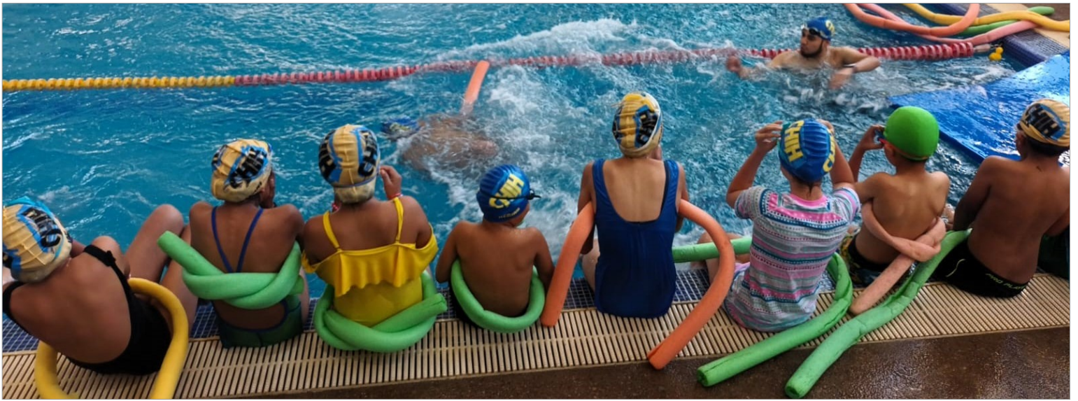
The girls and boys were invited by the city's College of Accountants to a swimming class at the municipal pool. After class, they were treated to breakfast. In the end, the kids were gifted a sports jacket and candy.