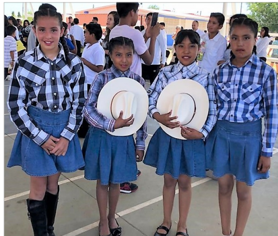
Girls participating in cultural dances

La Gran Familia is a registered 501c3 nonprofit organization