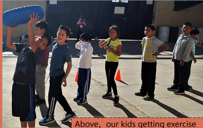
Above, our kids getting exercise