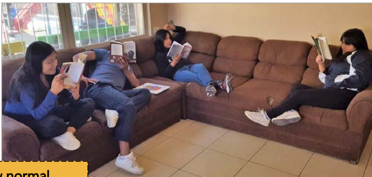
The new normal