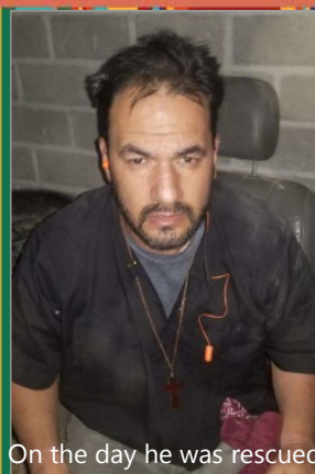
On the day he was rescued