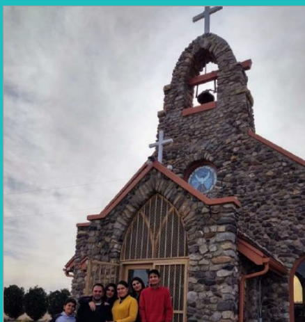
Iglesia del Gran Pastor